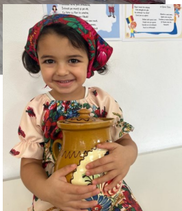
⇐ Celebrating Romania Day