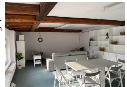
↑ Newly renovated upper room

the new room it means there is space to invite more girls. Currently there are 3 different girls groups, in the following age groups: 9-10 years, 11-13 years and 15-19 years. In total between the three groups we have 20 girls coming regularly.