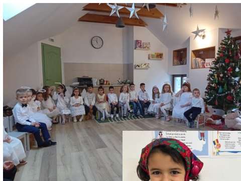
⇐ Kindergarten Christmas Celebrations